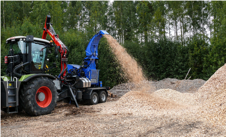
MOBILE CHIPPER 806.2 PT TRAILER